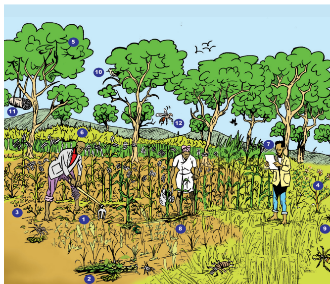
Figure 2: Agroecological approaches are low-cost options that farmers can use to manage fall armyworm. Some agro-ecological approaches to pest management: (1) Minimum soil disturbance enhances biological properties of soil; (2) Mulching crop residues improves soil and provides habitat for insect predators; (3) Inter-crops improve soil fertility and diversifies the field environment; (4) Shrubs with flowers support populations of parasitic wasps; (5) Trees provide perches and roosts for birds and bats; (6) Crop rotation improves soil fertility management and diversifies the farm environment; (7) Scouting to identify pests and assess damage enables informed pest management decisions; (8) and (9) Diverse field margins provide habitat for predators; (10) Insectivorous birds and bats reduce pest abundance in diverse agro-ecological systems; (11) Insect hotel for predatory wasps; (12) Predatory wasp .