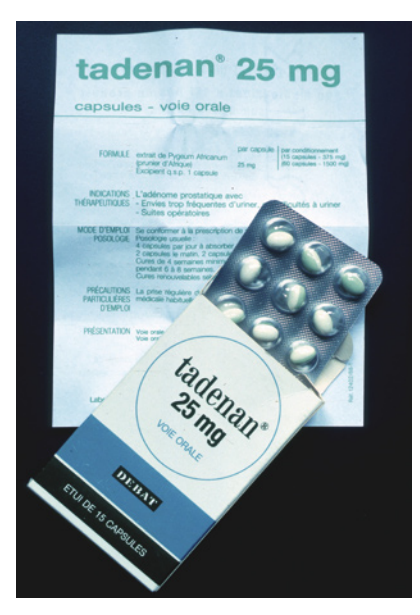
Photo 4. Prunus africana bark and extract, exported from Madagascar, Kenya, Burundi and DRC, is used to produce 40 brand-name products with a global overthe-counter value of US$220 million.

forest-agriculture, forest-mining, forest-energy, forest-water) feature more prominently in these plans.