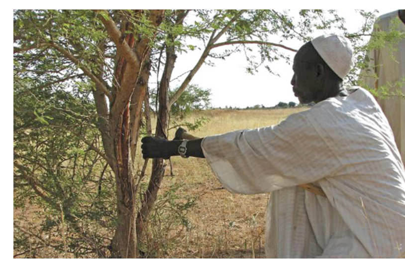
Photo 1. Expanded trade in gum Arabic ( Acacia senegal ) has the potential to arrest desertification in the Sahel, provided significant economic benefits flow to smallholders.

Biofuels. The rising demand for renewable energy has generated great interest in Africa as a new frontier for biofuel production: African countries are assumed to have large expanses of unutilized land, high levels of unemployment and cheap labor. These optimistic views are backed by an understanding of the particular suitability of Jatropha curcas in the region for its ability to adapt to conditions of low soil fertility and moisture. However, the anticipated scale and nature of benefits is largely based on speculation. Little is known about the potential of biofuels or Jatropha to address