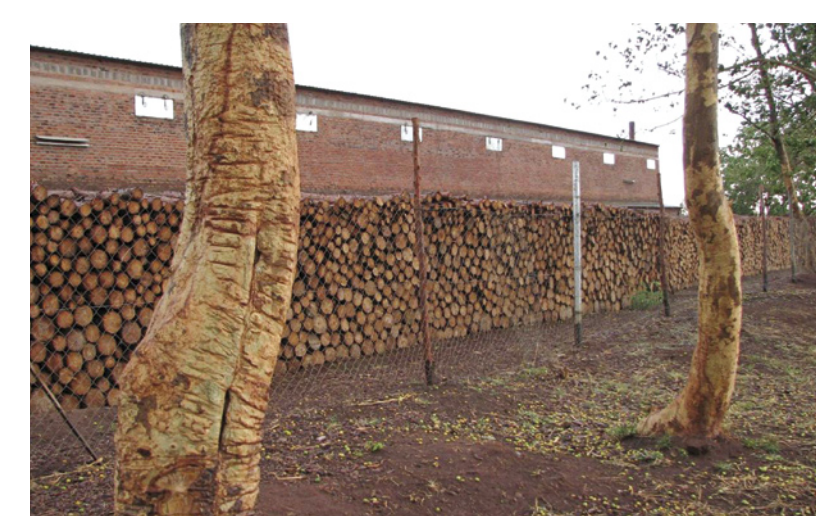
Photo 3. Wood stockpiled outside a tobacco processing plant near Lilongwe. Use of indigenous timber for fuel has nearly wiped out Malawi's natural forests, creating an urgent need for planning to match demand with supply and regulate corporate practice.