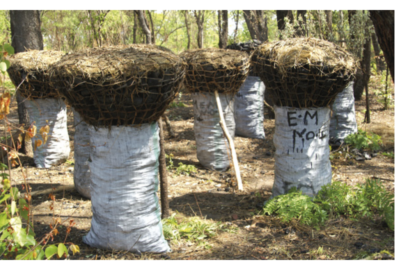
Photo 2. Production and marketing of charcoal and fuel wood in Zambia is estimated at $5 billion dollars, employs more than 400,000 people and contributes approximately 2.3% to the GDP.

to the transaction costs, uncertainties and risks of forestry-related CDM projects. While some countries in eastern and southern Africa are experimenting with voluntary (non-market) transfer payments for afforestation, most attention is now going to the potential of a new instrument – Reduced Emissions from Deforestation and degradation (RED) – under the second international climate treaty to come into effect in 2012. RED is focused on conserving existing forests rather than creating new carbon sinks, and is therefore of most interest to forest-rich COMESA member countries. Yet secure land tenure and participation of communities in the design of payment redistribution mechanisms will be required for forest-dependent communities to benefit.