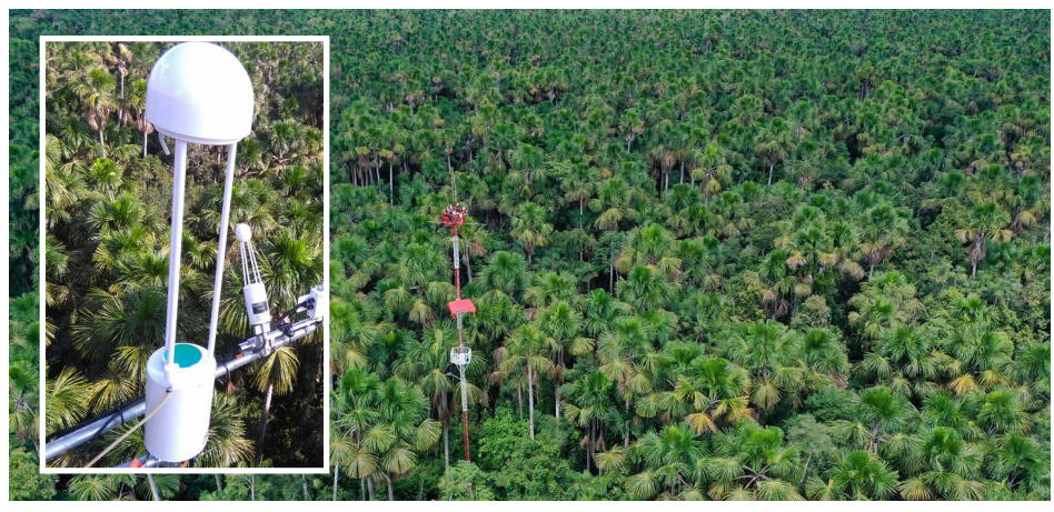
Eddy covariance tower for intensive carbon monitoring over palm (Maruritia flexuosa) dominated peatlands, Quistococha, Iquitos, Peru.

Sustainable Wetlands Adaptation and Mitigation Program (SWAMP) Enhanced wetland management in SWAMP countries for climate change adaptation and mitigation RESEARCH PRACTICE POLICY Scientific analysis, research and Operationalization of improved Improved integration of enhanced wetland management into national development knowledge product are accessed and shared evidence-based management Demand-driven scientific research. Support models, methods and Increased capacity and awareness of analysis, knowledge products and tools, developed and available government policy/decision makers publications are undertaken/developed Database available in public domain Capacity building supported catalyzing useful exchange maker engagement in dialogues pertaining to the global agenda and relevant for national contexts Capacity building supported for enhancing scientific research and analysis