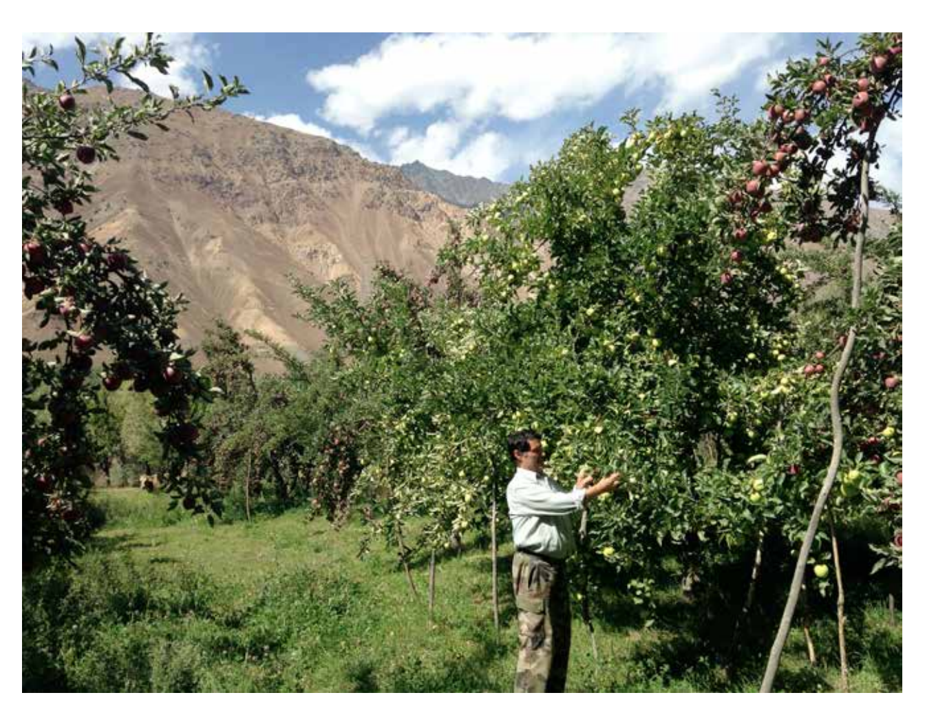
Apples ready for harvest in Vanj Valley.

called upon to work.<sup>14</sup> Most commonly, children work at the same time as they attend school and complete domestic chores. A great deal of their labor consists of farm work alongside their families in or around their homes, such that 83% of working children are involved in agriculture, especially during the summer months (ILO and IPEC 2015, vi). Thus, Tajik children have to work to help their families produce food, while lacking the nutrients they need to grow.