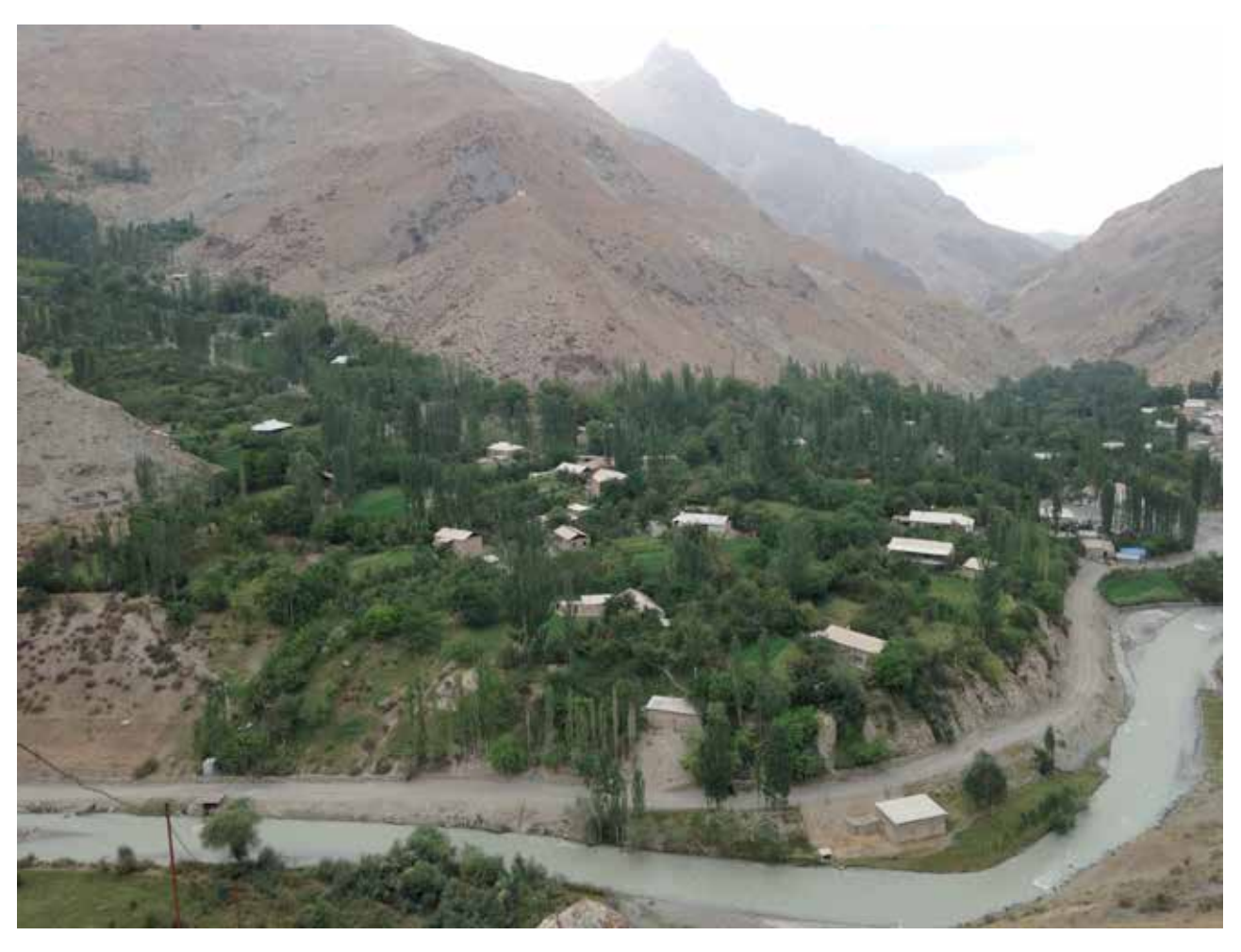
Typical mountainside village surrounded by orchards and woodlands above the banks of the Zimtud river.

Local residents have taken on a greater role in ecological management as they witness the Tajik government failing to meet its official obligations. The Committee for Environmental Protection (CEP) was established in Tajikistan in 2008 to regulate the use of natural resources and ensure their protection. During the Soviet era, this task had been distributed among several ministries and departments, such as the Ministry of Water Melioration, the Ministry of Agriculture, the Ministry of Health, the State Forest Authority, the Administration on Geology and the Committee on Industry. The CEP has struggled to reach basic funding levels and has extremely limited authority if infractions are found. While there is a comprehensive listing of environmental fines and valuations of forest products, this information is not available to the public nor are there CEP officials in rural areas to enforce them.