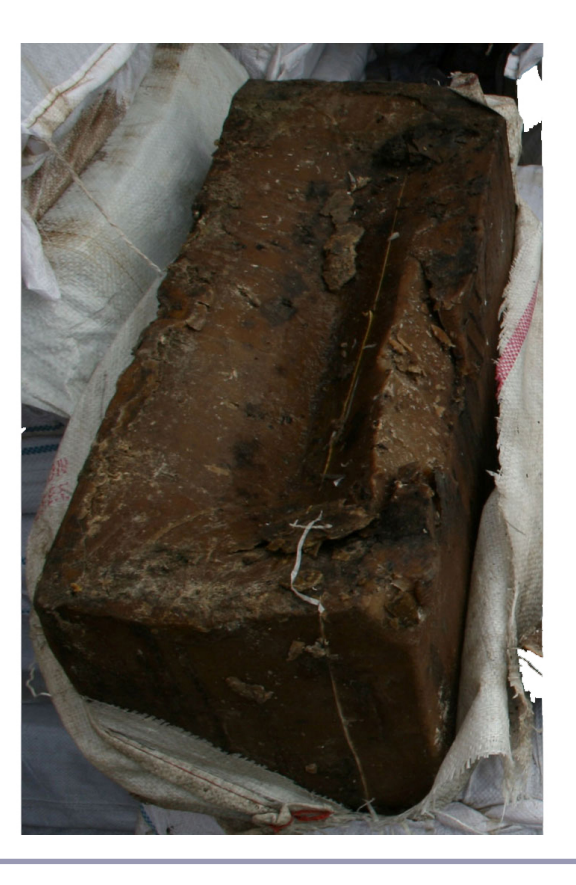
Fig. 2. Smoky black wax

beekeepers are affiliated in 32 villages around Ngaoundal, with three cooperatives being "preferred suppliers" in the Northwest. To date, over 100 tons of wax and about 20 tons of honey have been exported and twice that amount is sold locally in Cameroon, at prices up to 50% higher than normal market prices for the Ngaoundal beekeepers. Propolis is now being bought at a price double that for a kilo of honey, with first year orders for over 100 kg from Europe and the USA. It used to be thrown away. The beekeeping families are now experimenting more and producing apiculturebased products such as candles, soaps, creams, and honey wines (Fig. 4). Yves and Verina's scientific backgrounds are again being used as they research product recipes and advise on marketing and business development models to see what products can be used and adapted locally to initiate new value chains. Examples of the increases in beekeeper incomes are now apparent in the communities; they range from purchasing a zinc roof for the house, to a motorbike to take products to market, more children are going to school, and women can afford