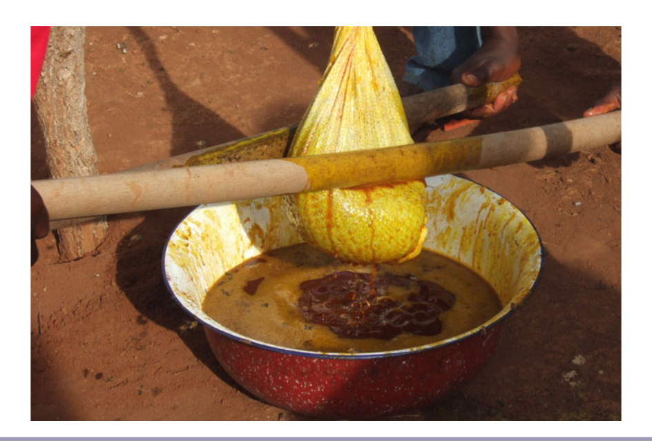
Fig. 3. Yellow wax

beekeeping is traditionally done by individuals or families and not as a collective activity, on average 68% of households in Djerem are involved in beekeeping. For 55% of these families it is their primary income source, providing up to 48% of total household income. Seasonal botanic variations allow for two harvests in some years and wide flowering variations in alternating years, leading to highs and lows of production in the savannah and mountain forests annually. Weather changes also strongly influence the quality and quantity of production, resulting in extremely variable incomes. A second survey is planned for 2011 to assess and monitor the socioeconomic impact in detail and see through the natural trends to assess the effect on livelihoods of Guiding Hope's actions.