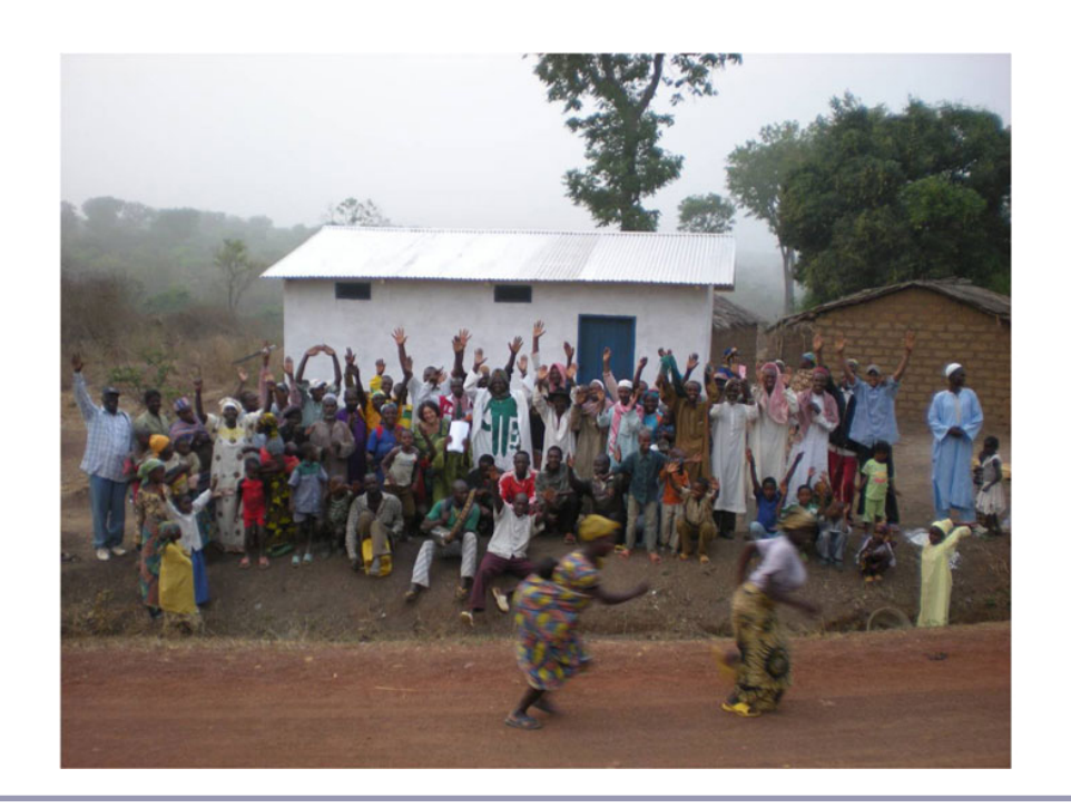
Fig. 5. Guiding the hope of beefarmers in Ngoundal. Collection center inauguration with village suppliers, March 2009

and Society for initiating a "Practitioners Award" and thank the Editor and Subject Editor for their constructive review comments.