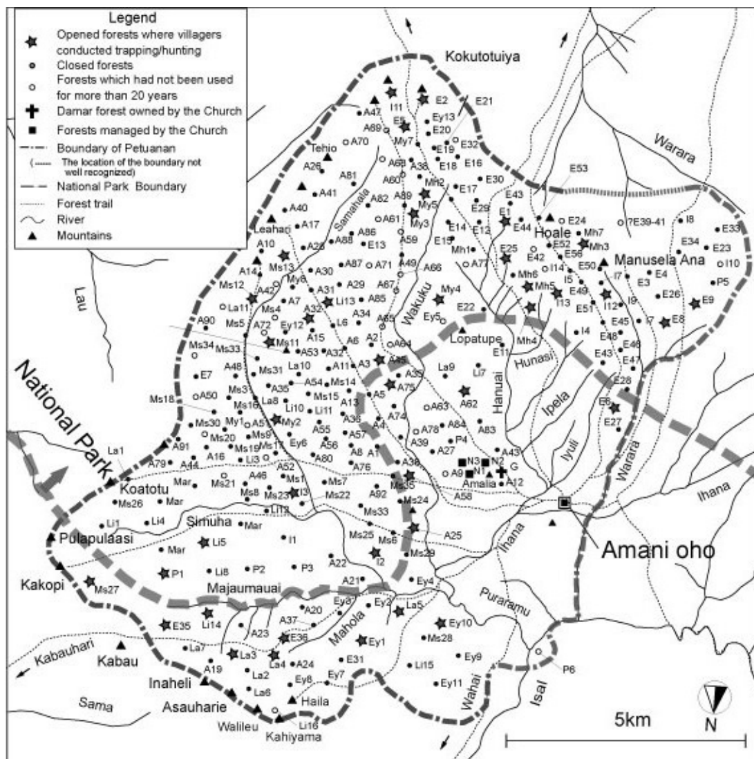
Fig. 3. Forest lots used for hunting and trapping in Amani oho territory.

However, we observed recent transformations in local forest resource management such as the application of sasi gereja (church prohibitions) on forest resource use.