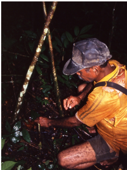
Fig. 2. A villager conducts a ritual to impose seli kaitahu .

After the ritual is completed, no one, including the owner and the person who imposed the seli kaitahu , can trap or hunt in that area until the numbers of forest game recover. The villagers strongly believe that if they violate the seli kaitahu , they or their family members will meet with misfortune because of the sanctions imposed by the spirits.