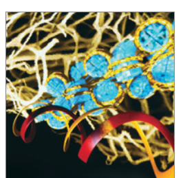
Molecular Biology International