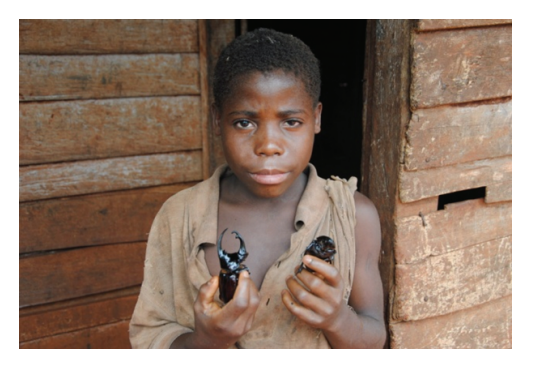
FIGURE 3: Baka child with a couple of Augosoma beetles.

However, the abundance of this insect varies from year to year and there is usually an outbreak of its population every two years. The larvae of the beetle, however, are available yearround and can be gathered whenever need be. The adults are harvested on electrified spots at night or on locally known Augosoma attracted (host) plant species like raffia ( Raphia sp.) and Pandanus ( Pandanus candelabrum ). Adults attracted to light are gathered by simple hand-picking when they settle on the ground or on objects around the electrified spots.