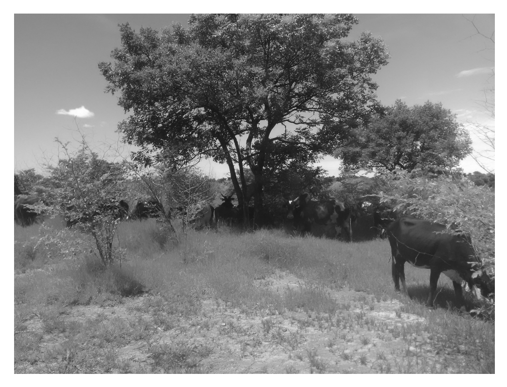
Figure 3. Pastureland in Tsaramandroso dominated by Zizyphus mauritania

fananganan'aomby in Ambalakida and Betsako Communes and kijan'aomby in Mariarano, Katsepy, Tsaramandroso, and Ankijabe Communes. Tany fananganan'aomby is a combination of the words tany (land), fananganana (gathering), and aomby (zebu). Kijan'aomby combines the words kijana, (unenclosed resting site) and aomby (zebu). Kijan'aomby refers to the areas where zebu gather to rest during the night, whereas tany fananganan'aomby is a broader term that refers more generally to areas where zebu gather. However, a kijan'aomby is also where the herd is gathered periodically so that the owner can verify the number of zebu present. In practice, the terms tany fananganan'aomby and kijan'aomby refer to the same place. To avoid confusion, in the remainder of this article we use the term tany fananganan'aomby, rather than kijan'aomby.