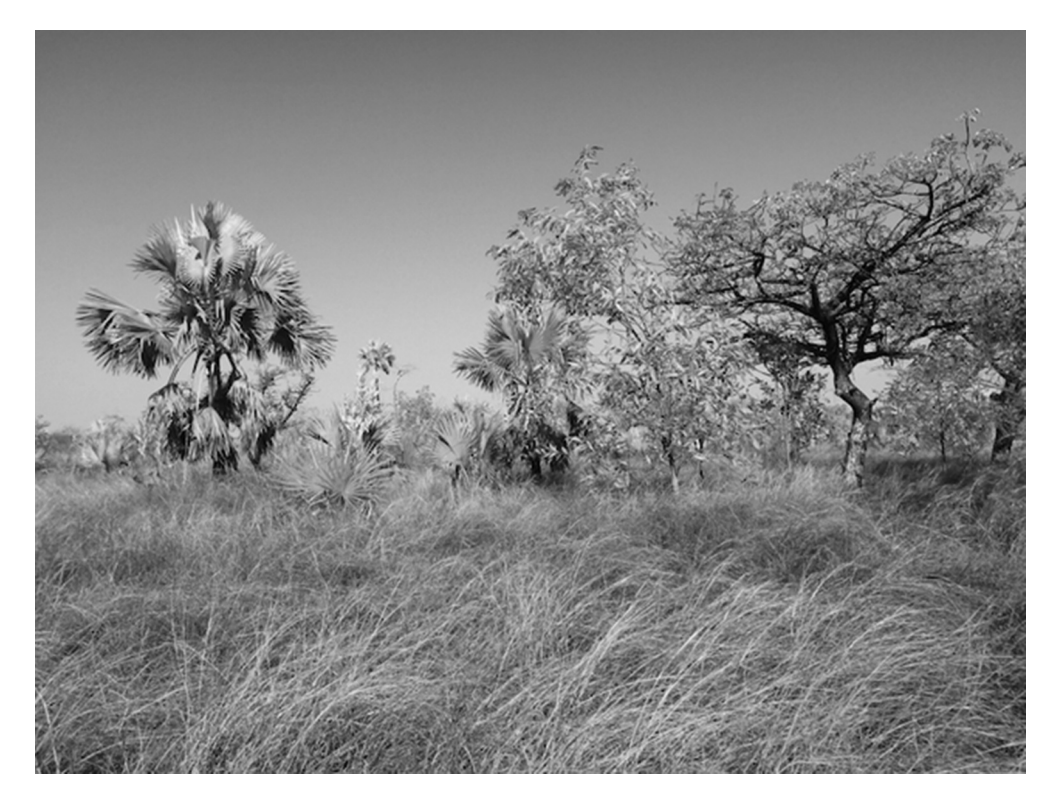
Figure 2. Pastureland in Mariarano dominated by Bismarckia nobilis

Herders take zebu to the tany firaofana during the morning, monitor them during the day and bring the zebu back to the village at night. When grazing in the tany firaofana , zebu may travel as much as several kilometers a day in search of fodder and water. The distance covered by the animals depends on the quantity and quality of the fodder available, which in turn depends on the seasonal cycle. As a result, tany firaofana boundaries are neither exact nor fixed. Nonetheless, local inhabitants can readily identify approximate boundaries using hills, streams, rivers, and other natural features as landmarks. The daily activities of the zebu in the tany firaofana revolve around the matsabory , which may be either periodic or permanent water sources. During the height of the dry season, the herds wander much further in search of water. Although the tany firaofana 's main use is as a pasture, it is a multi-functional landscape in the sense that all community members have the right to fish in the matsabory . They also have rights to gather Bismarckia nobilis leaves for thatching roofs, harvest wood from Zizyphus Mauritania to make charcoal, and collect food and medicinal plants, as well as dry wood for fuel.