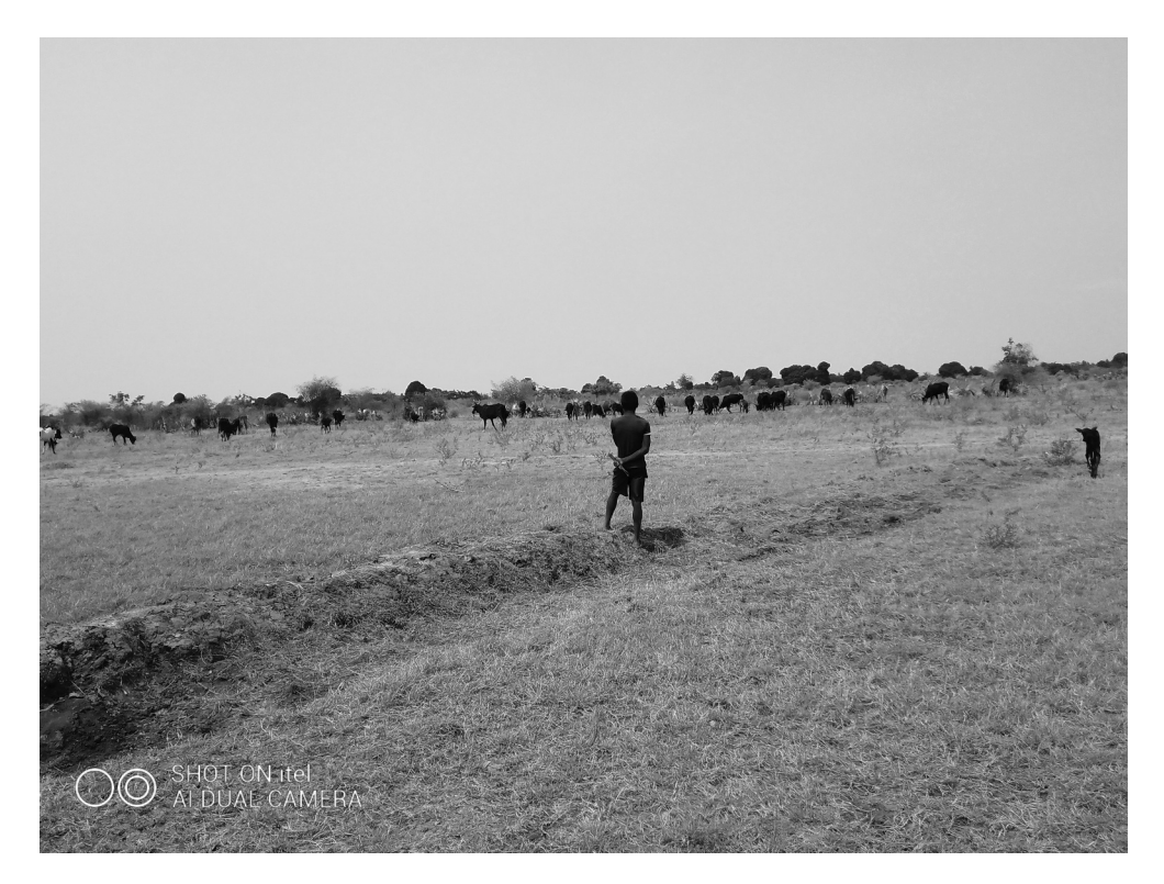
Figure 6. Tsimanja with aomby asesy

remuneration may consist of one or two zebus depending on how fast the herd increases, or they may be paid in cash. Although the number of zebu in a herd varies, study participants indicated that an aomby asesy herd typically has about 50 head of zebu.