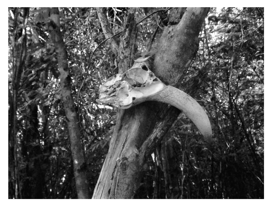
Figure 4. Vody kijana with zebu skull indicating that the joro kijana ritual has taken place

Composed of trees, shrubs, and unvegetated areas, the tany fananganan'aomby offer shade and coolness for the herd. They also are a source of construction wood for local households. In most cases, tany fananganan'aomby are located near matsabory . Even though the tany fananganan'aomby cover much smaller areas than the tany firaofana , their boundaries are also fluid since the radius of the imperfect circle formed around the vody kijana varies with the size of the herd. The tany fananganan'aomby are generally located several kilometers away from villages. This protects the zebu raisers and their families, as well as other villagers, from attacks by zebu thieves.