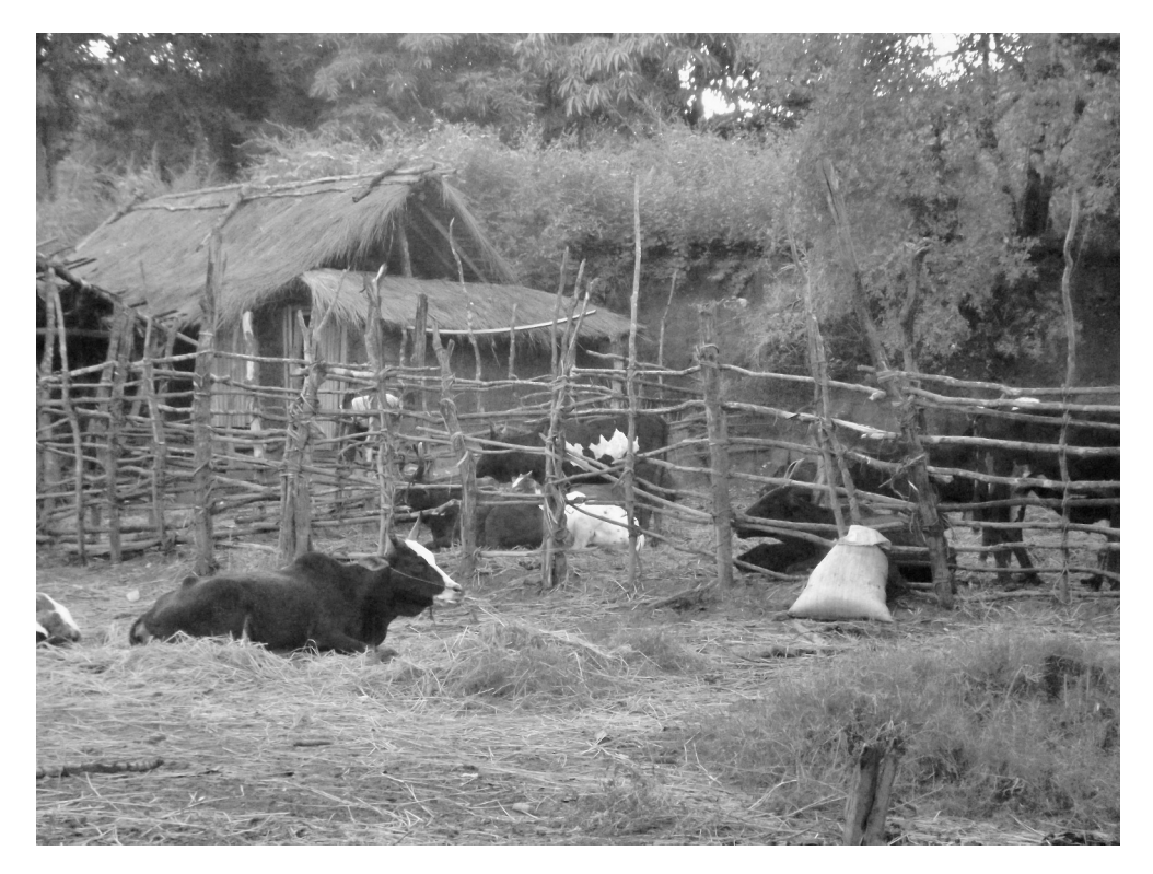
Figure 5. Vala where aomby asesy are kept at night

Herders, or tsimanaja are generally hired by the zebu owners to accompany the zebu to and from the village and to monitor them while they are grazing (Figure 6). Tsimanaja are typically men and can be either family members or employees. They can also be children, young people, or elderly people. If they are employees, their