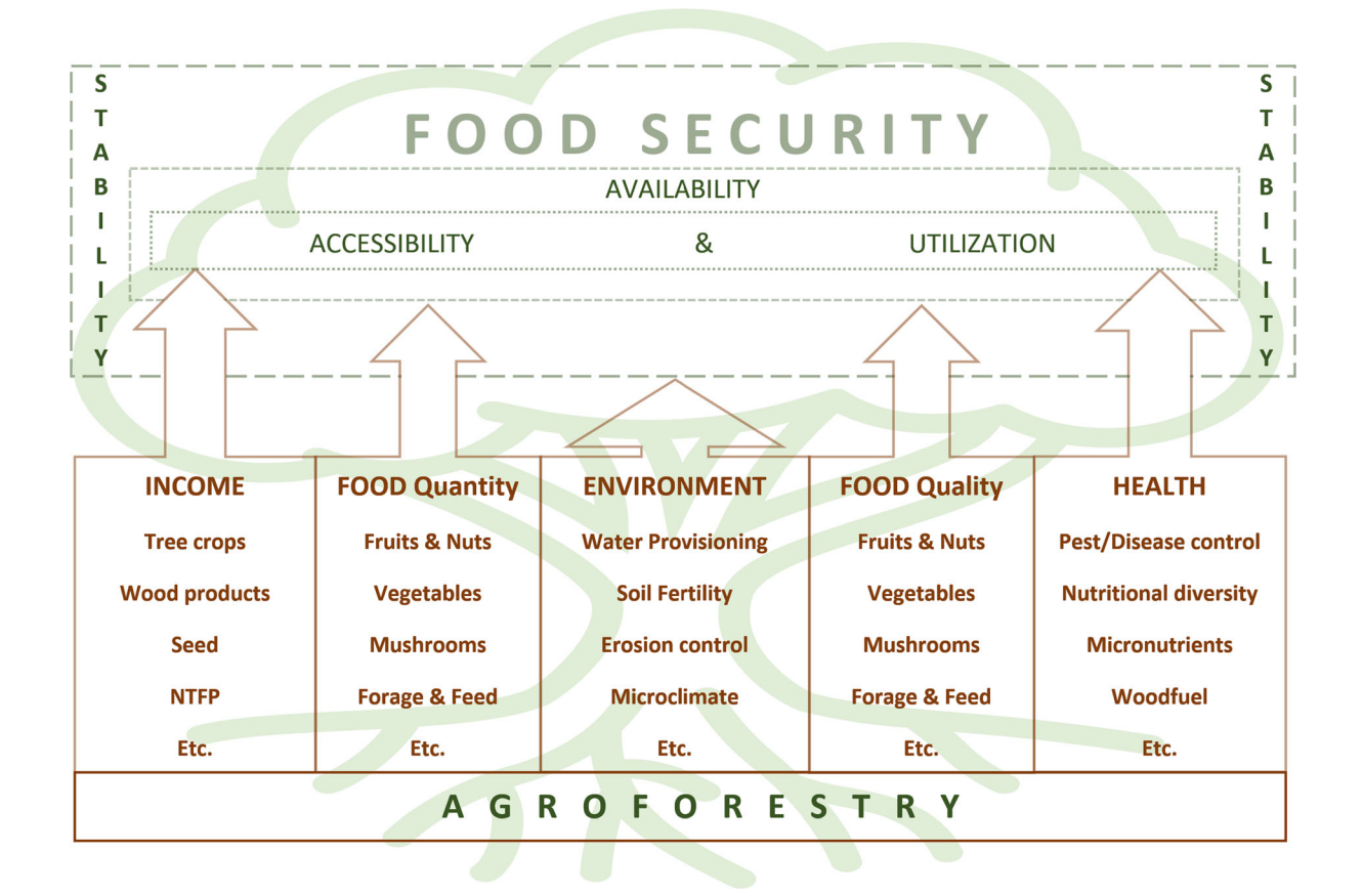
Fig. 1 Simplified diagram of agroforestry pathways for food security

The availability of higher qualities and quantities of outputs from agroforestry systems can support the other two pillars. The FAO (2015) defines food utilization as the requisite "healthy physical environment", "knowledge and habits, including storage,..." and "ability of the human body to take food and convert it into [...] energy..." and food accessibility as "when all households have enough resources to obtain food in sufficient quantity, quality and diversity for a nutritious diet." In addition to the aforementioned environmental benefits, agroforestry has the potential to increase utilization through contributions to income, nutrition and health status as some agroforestry outputs can have biomedical attributes, while others constitute commodities [such as nuts, coffee, cacao, fuelwood, and other non-timber forest products ("NTFP")] that can be sold, stored for long periods, and/or utilized in food preparation (Rao et al. 2004; Roshetko et al. 2008; Jamnadass et al. 2015). For example, agroforestry fuelwood lots can reduce labor