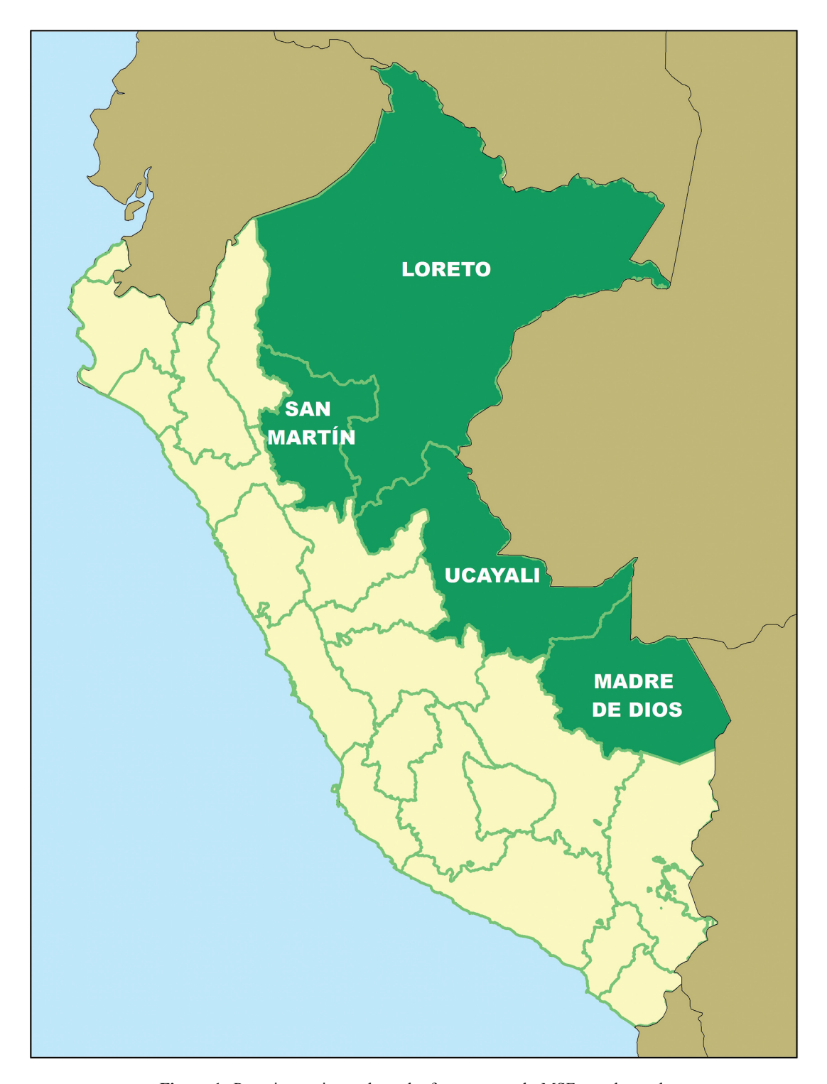
Figure 1. Peruvian regions where the four case study MSFs are located.