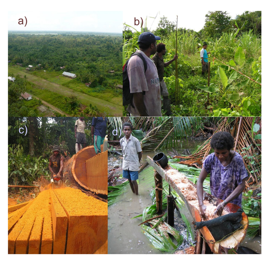
Figure 4. Impacts of human activities are visible around Papasena and its nearby territory as exemplified by an aerial view of the main settlement (a), sampling in a newly opened mixed garden (b), timber cutting (c), and sago processing within the sago swamp forest (d).