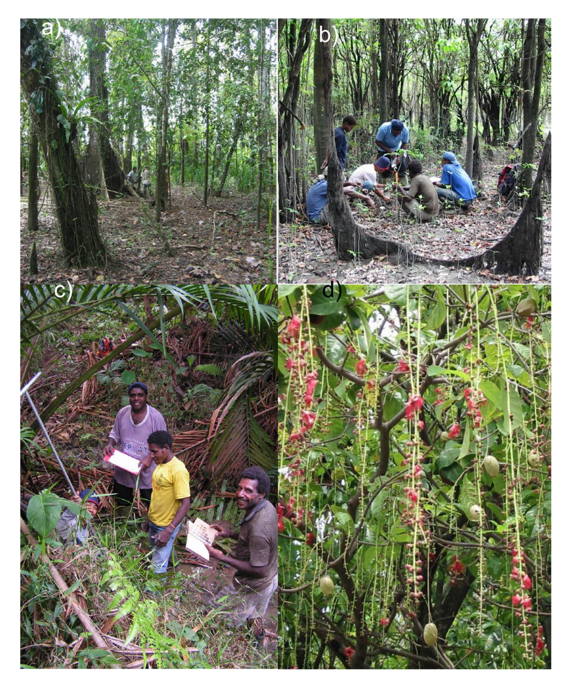
Figure 3. Floodplain forests in the Mamberamo Basin include swamp forests (a), seasonally flooded lakeside forests (b), and sago forests (c) and included distinctive trees such as these flowering Barringtonia sp. (d).