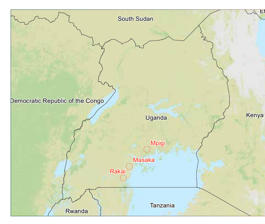
Figure 1. Location of districts in Central Uganda where AUPWAE conducted ACM work.

"It's such a patriarchal society that women traditionally don't own land, and even their access to land is limited," says Concepta Mukasa of the Association of Uganda Professional Women in Agriculture and Environment (AUPWAE). "So they might be able to plant a couple of trees for their own subsistence use, but that's all – and even if they're involved in planting, they're not benefitting, especially economically."