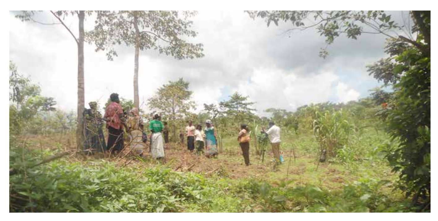
Photo 1. Members of Mbazzi Farmers Group members carry out a monitoring visit in their newly allocated area planted with trees.

Mbazzi Farmers' Association, Mpigi District, Central Uganda