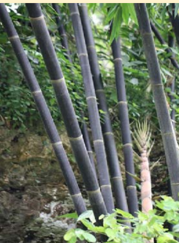
"Healthy" and "Unhealthy" clumps: enhancing understanding on best practices in bamboo clumps management for continued raw materials in craft making