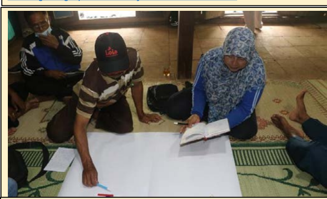
Reflecting lessons learnt from transect in identifying species for different products, and from observation on "bad and best practices" in bamboo management

Link: https://forestsnews.cifor.org/73646/seal-of-approval-for-gunung-sewuunesco-global-geopark-karst-ecosystem-in-indonesia?fnl=en