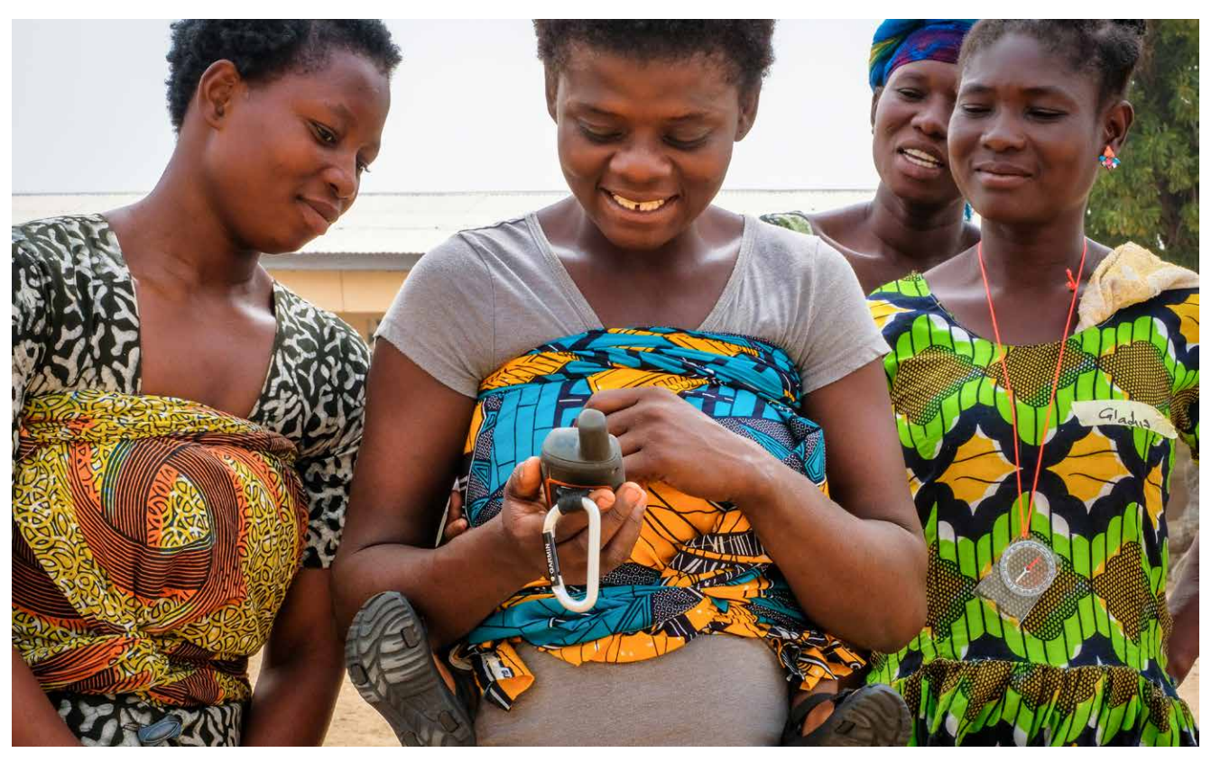
Mapping workshop in Nyangania, Kasena-Nankana West District - Ghana