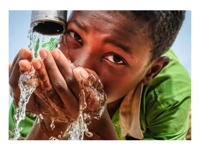
Hand pump well near Chiana, Kasena-Nankana West District - Ghana

settings. This type of social learning, also referred to as multiloop learning, is crucial for recognizing change and adapting to it in complex, dynamic socio-ecological systems (Maarleveld and Dabgbégnon 1999; Colfer 2005b).