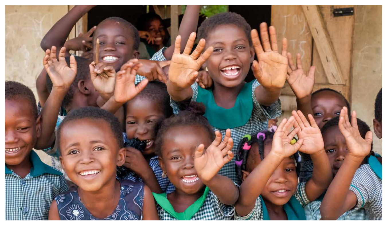
School time in Nakong, Kasena-Nankana West District - Ghana

practices have many benefits, such as adaptability, resiliency and biodiversity. Policy makers should be aware of these management practices and use them as the point of departure for development interventions.