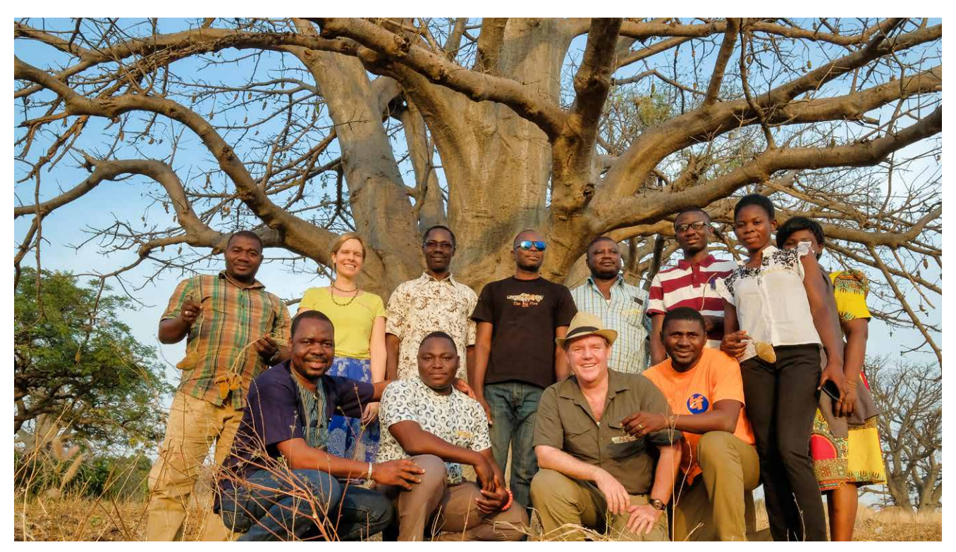
CIFOR and Tree Aid trainers near Chiana, Kasena-Nankana West District - Ghana