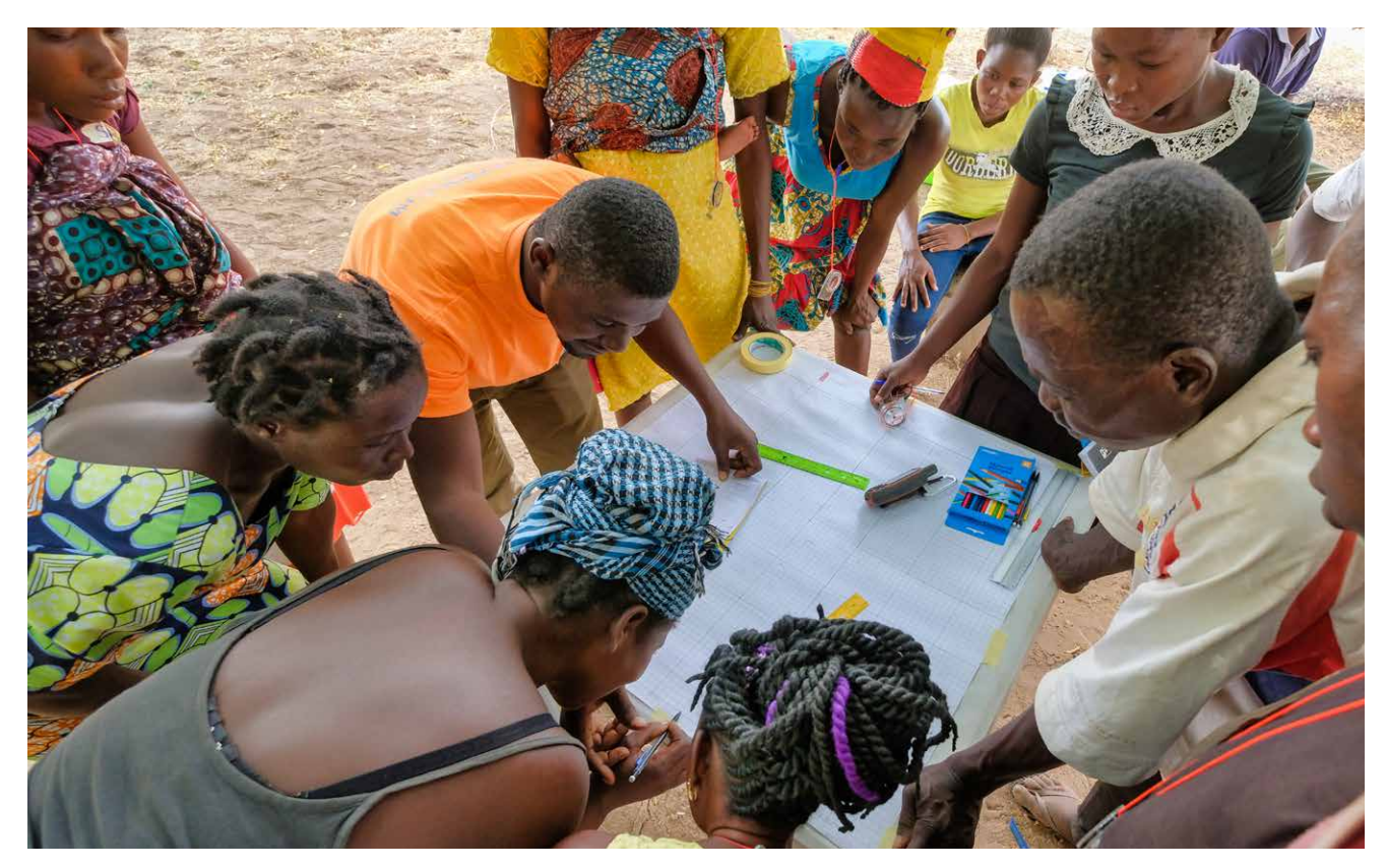
Mapping workshop in Adabania, Kasena-Nankana West District - Ghana

One final observation about introducing PAR methods into applied research and development initiatives. As this approach differs from conventional or top-down development interventions, it is necessary to devote time to training the technicians who will be facilitating the work and to provide guidance as they gain experience. In this approach, technicians need to be oriented to understand that they are assisting a process, and that it is in this process that people learn. The technicians may feel that it is counterintuitive to set aside their authority and allow participants to explore issues and make decisions on their own terms, but by opening up that opportunity, they help the participants gain skills and capacity. Providing support and feedback as the technicians become more confident in this role will help them become better facilitators.