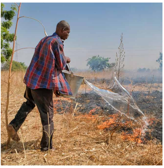
Spontaneous fire in Nakong, Kasena-Nankana West District - Ghana

For the farmers, the forest–farm interface is their reality – and sometimes it is hard for someone living a reality to see clearly the central issues and associated knowledge because they are immersed in them. By learning and exploring issues together