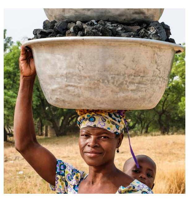
Going to the market with charcoal, Chiana, Kasena-Nankana West District - Ghana

Smallholders in northern Ghana and southern Burkina Faso have managed multi-use landscapes for generations, including woodlands, pastures, farmland and parklands. For these smallholders, the forest and farm have merged into multifunctional production systems where there are no hard borders between farming and forestry. Smallholder production often occurs within complex spatial and temporal mosaics, with multiple land uses and production activities shifting across their property over time. This landscape can be understood as the 'forest-farm interface,' where it is often difficult to clearly separate agriculture from trees and forest. Unfortunately, these smallholder systems are poorly accommodated by policies and programs that treat forests and agriculture separately. Rather than build on the advantages of these multifunctional systems, policies instead focus on the intensification of agriculture or conservation of forests instead of strengthening or improving the existing, successful smallholder systems. Existing management