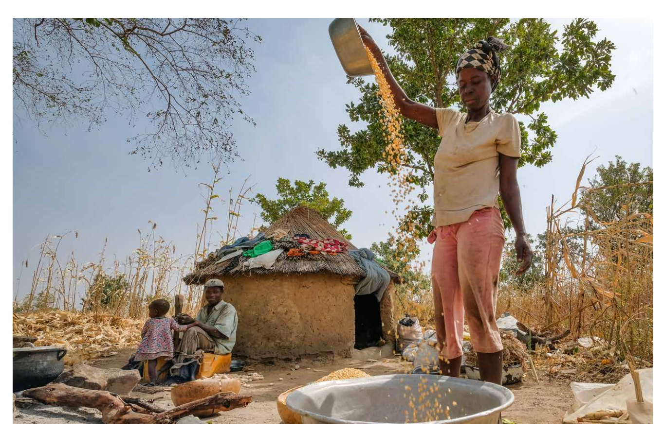
Woman cleaning maize near Chiana, Kasena-Nankana West District - Ghana

Distance to firewood? PAR participants were concerned that fuelwood supplies for household use have diminished, thereby increasing distances that women must travel to find fuelwood for household use. This is partially due to commercial firewood collection and charcoal production, which has depleted fuelwood supplies. Women also reported conflicts with forest guards who threatened women near forest reserves and confiscated their wood. When the PAR participants were discussing the increasing distances they traveled to gather fuelwood, this raised