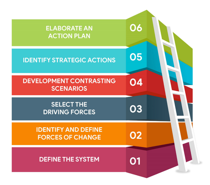
Figure 1. Sequential steps of PPA implementation

In Nepal, facilitator training was organized in November 2016, attended by 23 professionals and practitioners