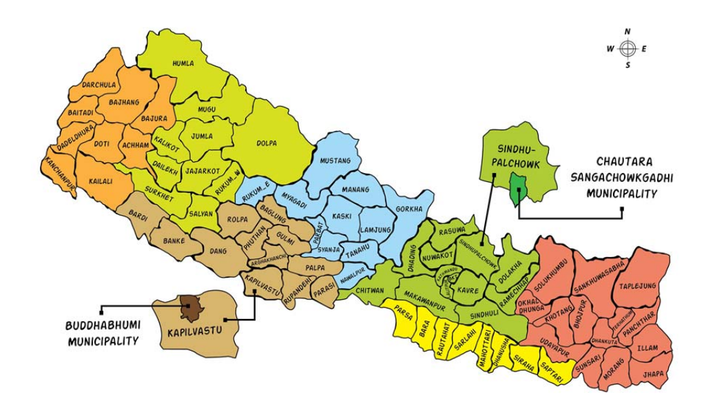
Figure 2. Map of municipalities where PPA activities were conducted

were also fears that local governments may start levying more taxes, and that partisan politics could jeopardize the success of community forestry. On the other hand, stakeholders were also hopeful that local government services would be provided faster, access to services would be easier, tenure security would be stronger, and collaboration with local governments would be simpler and more effective. These reflections were used to identify potential forces of change, many of which were related to the national legal frameworks, macroeconomic policies and changing political context. In order to focus on the aspects that they were able to influence, participants created a list of internal forces.