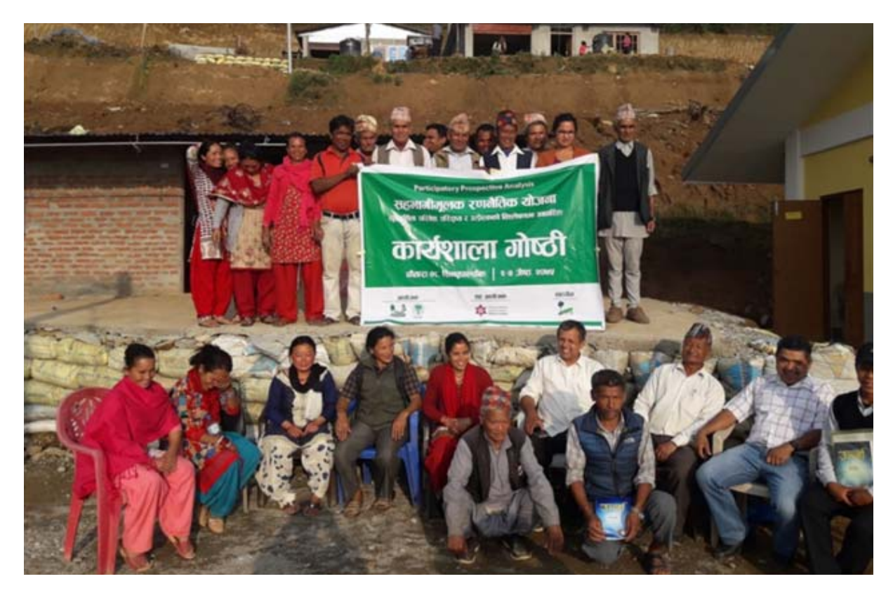
Figure 4. Participants at the PPA workshop in Nepal.