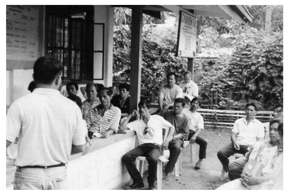
Figure 7.1. Raising awareness of farmers on the value of carbon sequestration in the ancestral domain.