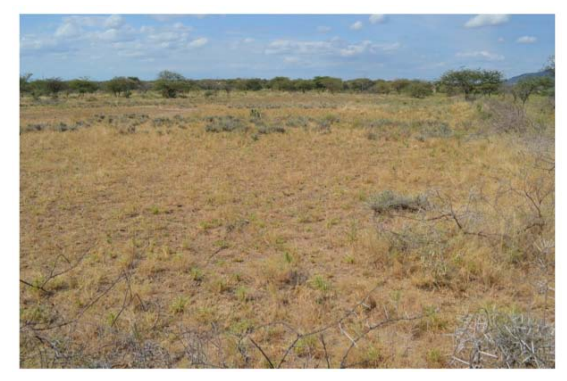
Community-based rangeland management in Kenya and Ethiopia. Photo showing the planned comparison on short-duration resting. Photo above shows the two-month resting effects in Kenya.